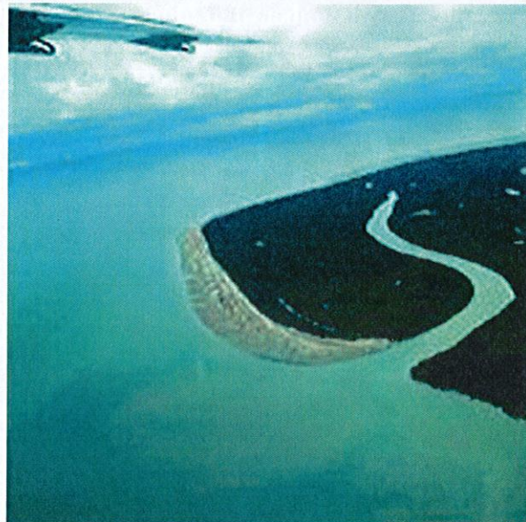
Flying into Tiwi

The NT Gambling Project has started in Wurrumiyanga. The aim of this unique health promotion project is to create a safe and supportive space for people to talk about gambling and to enable work with people to strengthen community action for activities that may reduce harm people experience because of card games and gambling. Through health promotion activities that are developed and driven by local people the project aims to build personal skills, provide information and re-orient health services. The team is also engaging with Pmara Jutunta and Willowra in the Central Desert region.