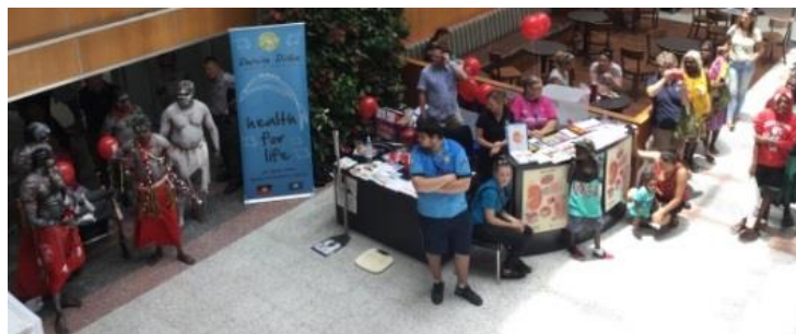
One message from Kidney Health Week was that dance is a great way to be active. The One Mob Different Country Dancers drew a crowd at the Danila Dilba Kidney Health Week Event.